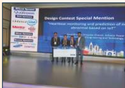
Special Mention Award at 'VLSI 2020 IoT Design', Bangalore