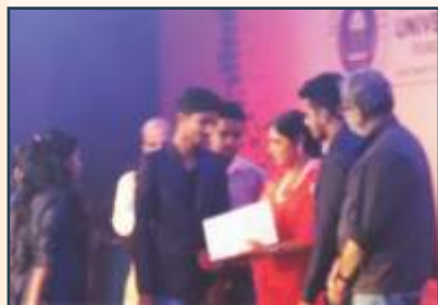
Winner 2018-19, National Level Project Competition MIT-ADT, Pune