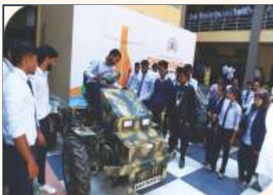
Winner 2017, Fuel Economy, Award, TIFAN, Rahuri