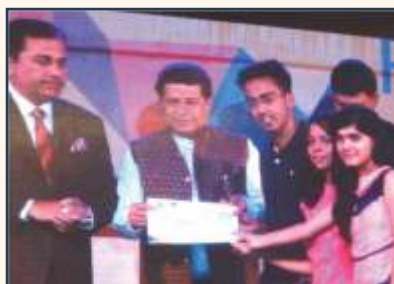
Winner 2017-18, National Level Project Competition, MIT-ADT, Pune