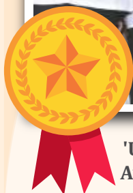
'Upcoming Technical Educational Institute in Maharashtra' Award, from CMAI, in National Education Award 16 (NEA'16)